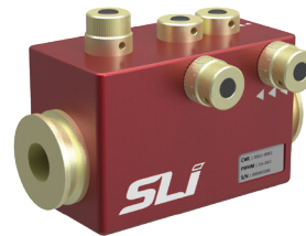
High Resolution FWS